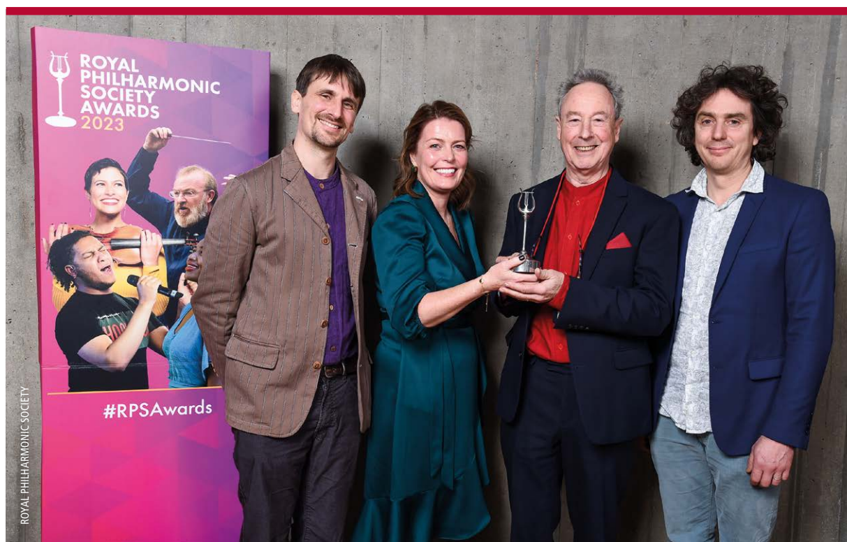
ROYAL PHILHARMONIC SOCIETY