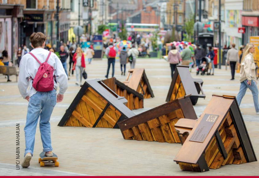
LIPC / NABIN MAHARJAN

Floating Pianos by Pianodrome.org – Like life-rafts on a rising sea, the pianos are symbols of hope in adversity.