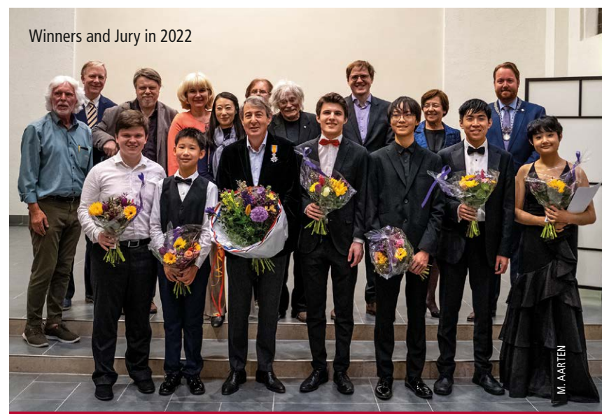
Winners and Jury in 2022