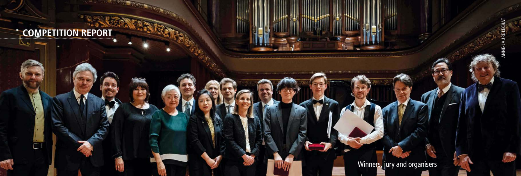
Winners, jury and organisers