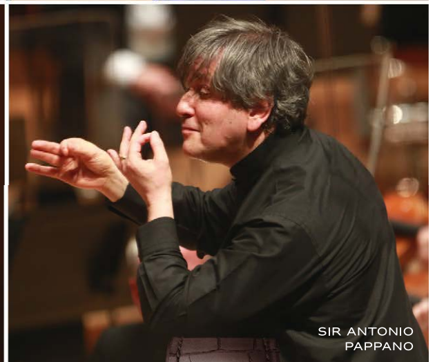
SIR ANTONIO PAPPANO