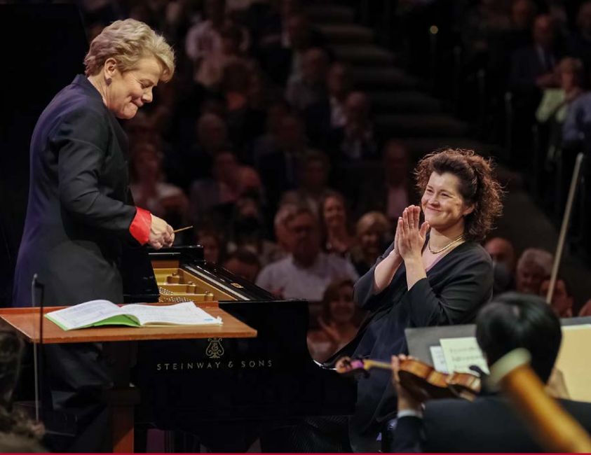
Together with conductor Marin Alsop at the Van Cliburn

When I started attending music school my mother was told she had to take care of my everyday practising on scales, which I certainly hated as much as I still do. I was always on the improvisational side and preferred to make some sound effects on the piano rather than keeping my fingers busy. I imagined myself being a sculptor and making new creations in silence no matter in which circumstances one would be put into.