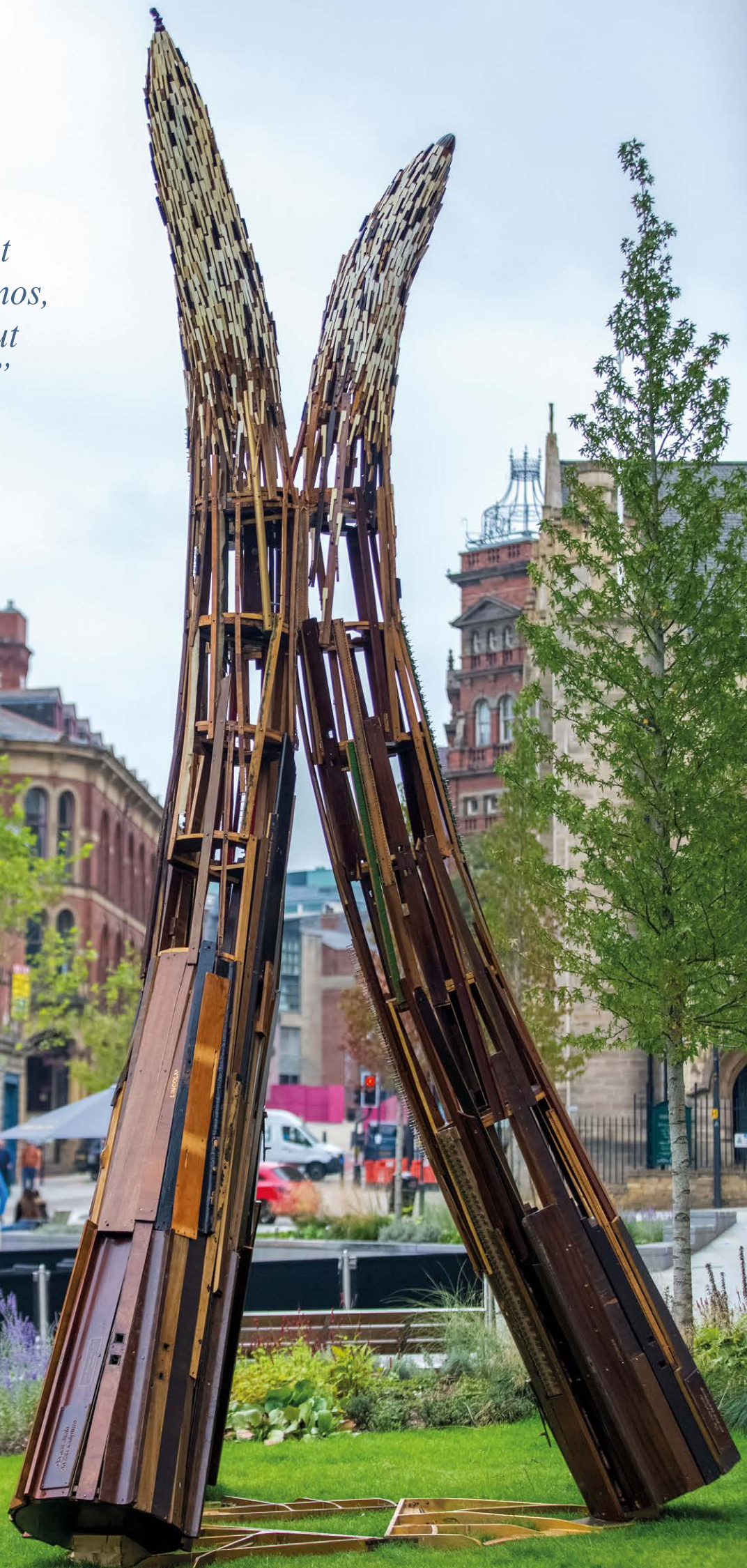
The Elephant in the Room by Pianodrome.org

“It’s not about pianos, it’s about people.”