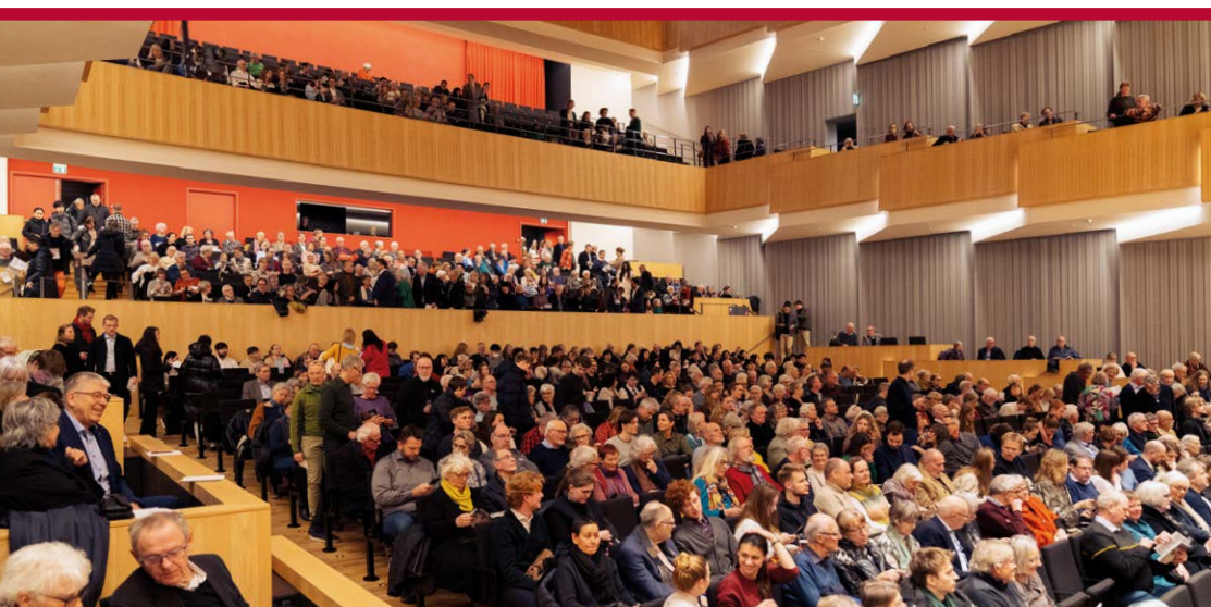
Full audience at the Symphonic Hall, just before the start of the finals.