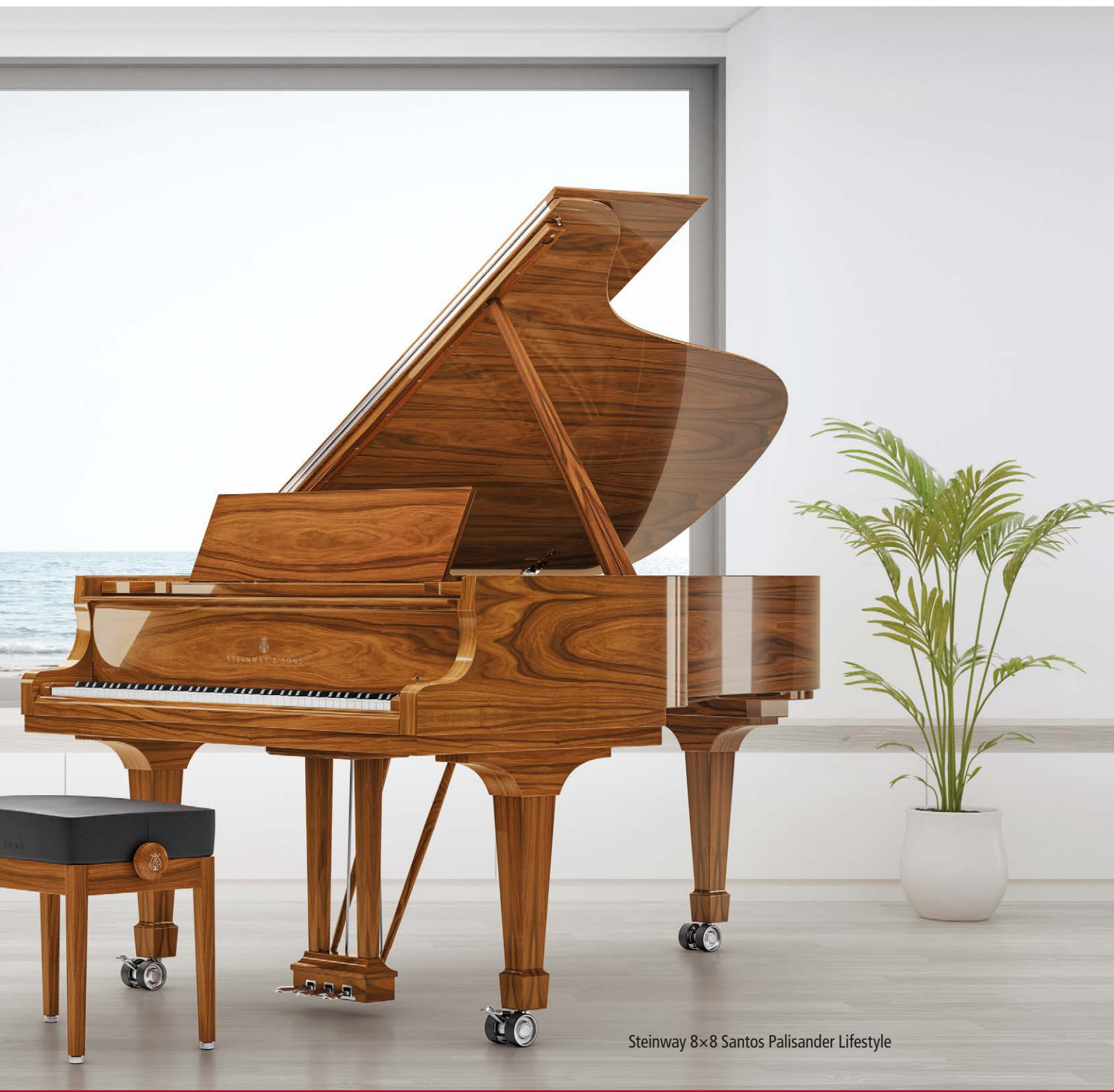
Steinway 8x8 Santos Palisander Lifestyle